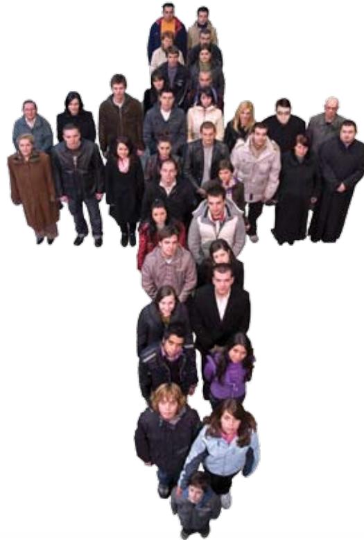
Christian symbol, Cross

Beloved, let us love one another, for love is of God; and everyone who loves is born of God, and knows God. The one who does not love does not know God, for God is love. (1 John 4:8)